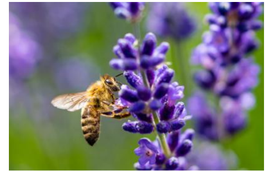
Pictured: A honeybee collecting pollen from a lavender plant.

On 20 th May, people around the world will celebrate World Bee Day. It is a special day to think about bees and other pollinators, and the important job they do. Bees help to pollinate many plants. This means they move pollen from flower to flower, helping plants grow fruit, seeds and more flowers. Without pollinators, many of the foods we enjoy would be harder to grow. World Bee Day began in 2018 after Slovenia suggested the idea to the United Nations. The date, 20 th May, was chosen because it was the birthday of Anton Janša, an important early beekeeper from Slovenia. Janša admired bees and once wrote, 'Among all God's beings there are none so hard-working and useful to man ... as the bee'. The 2026 theme is 'Bee together for people and the planet'.