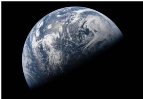
Pictured: Half-illuminated Earth, from Orion.

What can pictures teach us about our place in the universe?