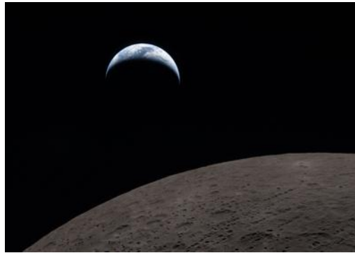
Pictured: A glimpse of the Moon with the Earth in the distance, from Orion.

The pictures were taken during last month's 10-day journey into space. Four astronauts travelled around the far side of the Moon in a spacecraft called Orion, before returning safely to Earth. The mission did not land on the Moon, but it helped NASA test important equipment for future