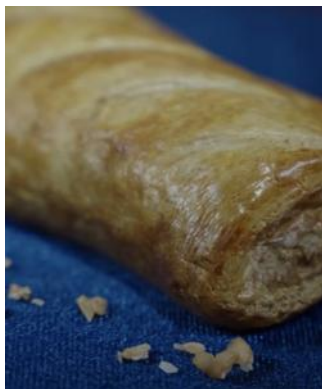
Pictured: A waxwork sausage roll complete with crumbs!