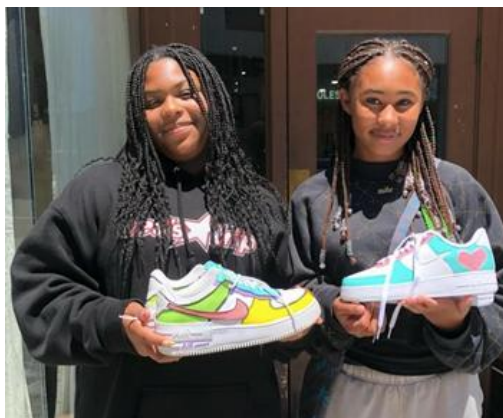
Pictured: "Customize Your Kicks" workshop participants and their designs.

A unique trainer repair shop in Oakland, which is in California, USA, is running cobbling and customisation classes for people to upcycle their old kicks! The SoleSpace Lab wants to reduce the amount of footwear thrown away, by fixing them and giving them a new look, often reflecting the wearer's personality and interests. The workshops introduce the craft of refurbishing old sneakers, including sewing, gluing and resoling. Every year, billions of new shoes are