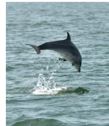
Pictured: A bottlenose dolphin.

Scientists from The Wildlife Trust of South and West Wales, have been studying the population of around 250 bottlenose dolphins living in Cardigan Bay, west Wales. Researchers have been trying to work out how the British dolphins behave beneath the waves, where we can't see them! They are particularly interested in what the dolphins could be eating and whether this is changing. This means they are becoming detectives - searching for and collecting dolphin poo before it sinks into the ocean. The excrement is then sent to laboratories at the University of Aberystwyth. Here, biologists use forensic-style DNA techniques to discover what the dolphins have been eating. Reports so far say these dolphins are adapting to a change in fish species as the sea water gets warmer.