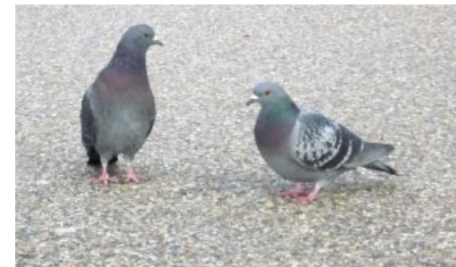
Pictured: Two pigeons back on the ground!

Then, just as the plane was ready to fly, a second pigeon popped up and gave everyone a bit of a surprise! The pilot had to call air traffic control and head back to the gate.