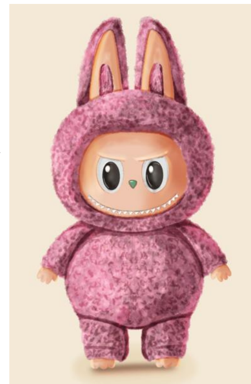
Pictured: A Labubu doll.

Labubu dolls are furry, mischievous-looking toys that have become a huge craze around the world. They were created by Hong Kong artist, Kasing Lung, and first appeared in a storybook series, called 'The Monsters', in 2015. A few years later in 2019, the company, Pop Mart, turned Labubu into soft toys. The character is described as an elvish creature, who is kind-hearted and always wants to help, but often ends up doing the opposite! Since then, Labubu has created dolls in many different colours, styles and outfits. The most popular Labubus are small pendants, around 15cm tall, which people like to clip onto their bags. They are often sold in 'blind boxes', meaning buyers don't know which one they are getting until they open it! Labubus became even more famous after celebrities, like Blackpink's Lisa, Dua Lipa and Rihanna, were seen showing them off.