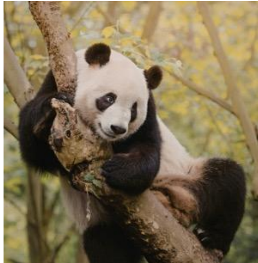
Pictured: Giant Panda climbing a tree.

Do you know any facts about giant pandas? Do you know any other animals that have been endangered?