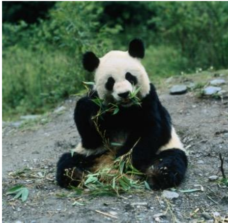
Pictured: Giant Panda eating.

China has declared that pandas are no longer endangered, and that its national animal has become a global symbol of conservation success. In the 1980s, there were fewer than a thousand of the black and white bears outside captivity. The animal's wild population has now almost doubled! Over the last 30 years, government-led recovery efforts,