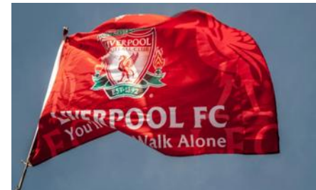
Pictured: Liverpool F.C won the Premier League last year in 2025.

Here's another football news story for you! The Premier League is one of the biggest football leagues in the world and is played in England. Teams play every week, fans cheer loudly, and one winning team lifts a special trophy at the end of the season. The Premier League began in 1992, over 30 years ago. Lots of teams have won it since then, but there is one surprising fact.