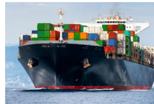
Pictured: A cargo ship in the sea, not on land!

Did you know some cargo ships travel for weeks or months without stopping?