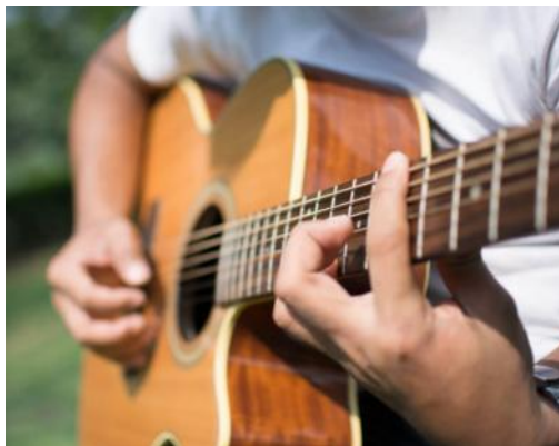
Pictured: An acoustic guitar.