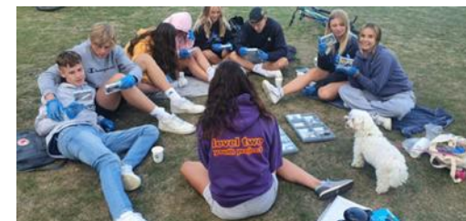
Pictured: A Level Two Youth Project meeting.

Last month, Suffolk youth charity, Level Two, took over a local art gallery! Their art exhibition showcased many different kinds of artwork created by children during sessions run by the charity. There was an open theme, but much of the work was inspired by nature. The children used paint, ink, clay, pencil and photography to express themselves. All funds raised from the exhibition at 142 Gallery in Felixstowe were donated to the charity, to help them continue offering a wide range of support and activities for school-aged children in the town and surrounding villages. Youth worker, Megan Pilcher, said, 'We are passionate about creating