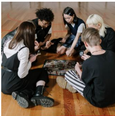
Pictured: Playing a board game.

Describing the new 'Offline Zone', the group said, 'It's like a living room for everyone to share!' A recent survey, from the British Standards Institution (BSI), found that 46% of teenage respondents would answer yes to the question: 'Would you erase social media from the history books if you could?' 68% also said they felt worse when they spend too much time on social media!