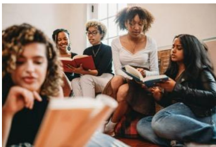
Pictured: Book club.

The world's first public 'Offline Zone' has opened in a busy train station in the Netherlands. It's a space for people to enjoy each other's company and partake in activities that do not involve the internet, such as chatting, reading, and playing board games. The initiative is a collaboration between The Offline Club and health insurer, Zilveren Kruis, who believe the space will improve the mental health of people visiting the zone. Dutch social movement, The Offline Club, is creating and promoting screen-free public spaces and events, encouraging people to meet for screen-free fun. It also hosts digital detox retreats, for guests to unplug completely from the internet.